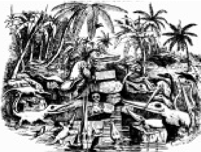
Cartoon inspired by William Buckland's lectures

Of more immediate interest, I knew nothing about the underground web of plants which exists, say, in woods and which can share food between all its members. I'm interested in this because I have recently helped create a tiny forest garden, and have visited a beautiful one of 2 acres on the Dartington estate. Within a community of plants, a mycorrhizal network can flourish, deep underground. This is a fungal web which links all the plants, so that nutrients can be passed