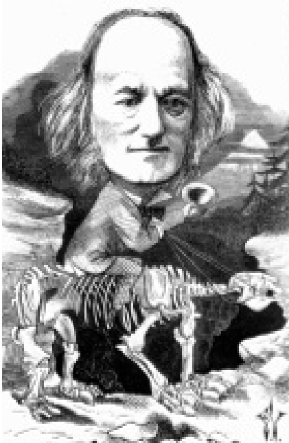
Richard Owen riding a Megatherium

member of its community. Loneliness is not a word in the fungal vocabulary'. The nourishing systems of living plants forming an invisible community flourishes underground, invisible to our eyes, as well as all the evidence of billions of years of past life always beneath our feet.